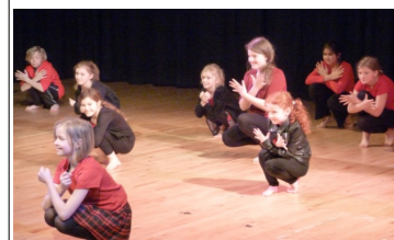
An extraordinary performance from our dance club members at the Dance Production, Coombeshead Academy.