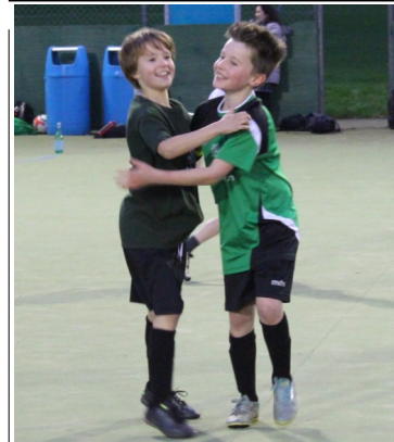
Odin and Fin celebrating a goal scored against Diptford at the latest CVL Football meeting.