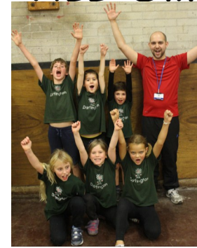
Dartington Primary School sent two year 3/4 squads to this year's Totnes Learning